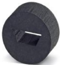
Seal for one AS-i line, 17.2 x 9 mm, from NBR, black, for IP65/67 degree of protection

Please be informed that the data shown in this PDF Document is generated from our Online Catalog. Please find the complete data in the user's documentation. Our General Terms of Use for Downloads are valid ( http://phoenixcontact.com/download )