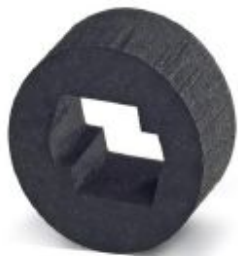
Seal for two AS-i lines, 17.2 x 9 mm, from NBR, black, for IP65/67 degree of protection

Please be informed that the data shown in this PDF Document is generated from our Online Catalog. Please find the complete data in the user's documentation. Our General Terms of Use for Downloads are valid ( http://phoenixcontact.com/download )