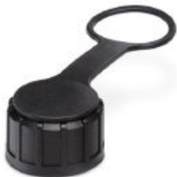
Protective cap, plastic, for QPD QUICKON connector, black, with holding band, IP68

Please be informed that the data shown in this PDF Document is generated from our Online Catalog. Please find the complete data in the user's documentation. Our General Terms of Use for Downloads are valid ( http://phoenixcontact.com/download )