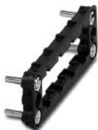
Panel mounting frame, without PE, for contact insert modules, type 4, number of insert modules 5, without screws

Please be informed that the data shown in this PDF Document is generated from our Online Catalog. Please find the complete data in the user's documentation. Our General Terms of Use for Downloads are valid ( http://phoenixcontact.com/download )