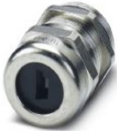
Metal screw connection for an AS-Interface flat-ribbon conductor, thread type M20

Please be informed that the data shown in this PDF Document is generated from our Online Catalog. Please find the complete data in the user's documentation. Our General Terms of Use for Downloads are valid ( http://phoenixcontact.com/download )