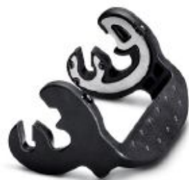
Replacement plastic single locking latch for standard housings of type B6

Please be informed that the data shown in this PDF Document is generated from our Online Catalog. Please find the complete data in the user's documentation. Our General Terms of Use for Downloads are valid ( http://phoenixcontact.com/download )