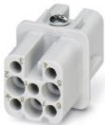
Contact insert, number of positions: 8, size: D7, number of connections per position: 1, Socket, Crimp connection, 50 V, 10 A, 0.14 mm 2 ... 2.5 mm 2

Please be informed that the data shown in this PDF Document is generated from our Online Catalog. Please find the complete data in the user's documentation. Our General Terms of Use for Downloads are valid ( http://phoenixcontact.com/download )