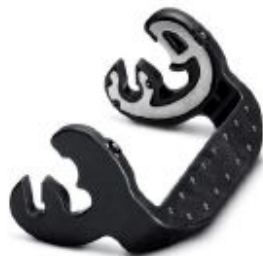
Replacement plastic single locking latch for standard housings of type B10

Please be informed that the data shown in this PDF Document is generated from our Online Catalog. Please find the complete data in the user's documentation. Our General Terms of Use for Downloads are valid ( http://phoenixcontact.com/download )