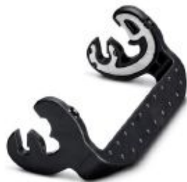
Replacement plastic single locking latch for standard housings of type B16

Please be informed that the data shown in this PDF Document is generated from our Online Catalog. Please find the complete data in the user's documentation. Our General Terms of Use for Downloads are valid ( http://phoenixcontact.com/download )