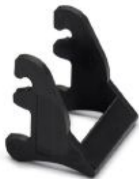
Replacement latch for HC-D7 plastic housings

Please be informed that the data shown in this PDF Document is generated from our Online Catalog. Please find the complete data in the user's documentation. Our General Terms of Use for Downloads are valid ( http://phoenixcontact.com/download )