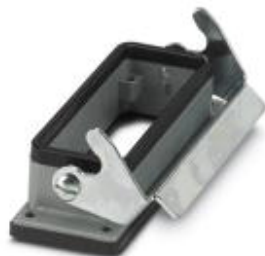
HEAVYCON panel mounting base B16, with single locking latch made of sheet steel, height 27 mm, with flat gasket

Please be informed that the data shown in this PDF Document is generated from our Online Catalog. Please find the complete data in the user's documentation. Our General Terms of Use for Downloads are valid ( http://phoenixcontact.com/download )