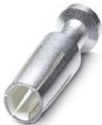
Turned 4.0 crimp contact, single socket contact, 10 mm 2 conductor cross section, silver-plated

Please be informed that the data shown in this PDF Document is generated from our Online Catalog. Please find the complete data in the user's documentation. Our General Terms of Use for Downloads are valid ( http://phoenixcontact.com/download )