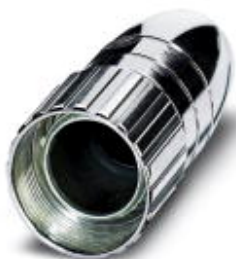
Cable connector, straight, Screw locking, M23, shielded: yes, cable diameter range: 2 mm ... 10.5 mm

Please be informed that the data shown in this PDF Document is generated from our Online Catalog. Please find the complete data in the user's documentation. Our General Terms of Use for Downloads are valid ( http://phoenixcontact.com/download )