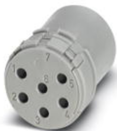
Contact insert, number of positions: 6, type of contact: Socket, Crimp connection

Please be informed that the data shown in this PDF Document is generated from our Online Catalog. Please find the complete data in the user's documentation. Our General Terms of Use for Downloads are valid ( http://phoenixcontact.com/download )