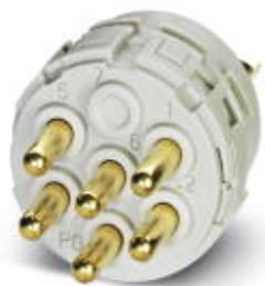
Contact insert, number of positions: 7, type of contact: Pin, Solder connection

Please be informed that the data shown in this PDF Document is generated from our Online Catalog. Please find the complete data in the user's documentation. Our General Terms of Use for Downloads are valid ( http://phoenixcontact.com/download )