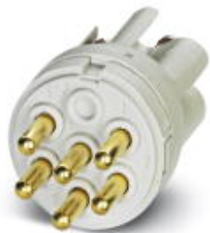
Contact insert, number of positions: 7, type of contact: Pin, Screw connection

Please be informed that the data shown in this PDF Document is generated from our Online Catalog. Please find the complete data in the user's documentation. Our General Terms of Use for Downloads are valid ( http://phoenixcontact.com/download )