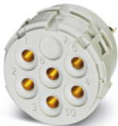
Contact insert, number of positions: 7, type of contact: Socket, Solder connection

Please be informed that the data shown in this PDF Document is generated from our Online Catalog. Please find the complete data in the user's documentation. Our General Terms of Use for Downloads are valid ( http://phoenixcontact.com/download )