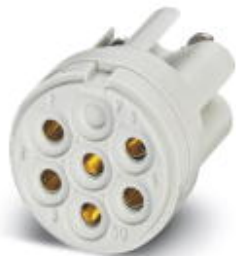
Contact insert, number of positions: 7, type of contact: Socket, Screw connection

Please be informed that the data shown in this PDF Document is generated from our Online Catalog. Please find the complete data in the user's documentation. Our General Terms of Use for Downloads are valid ( http://phoenixcontact.com/download )