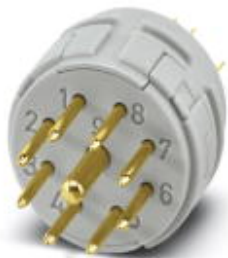
Contact insert, number of positions: 8+1, type of contact: Pin, Solder connection

Please be informed that the data shown in this PDF Document is generated from our Online Catalog. Please find the complete data in the user's documentation. Our General Terms of Use for Downloads are valid ( http://phoenixcontact.com/download )