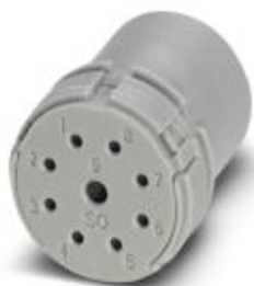
Contact insert, number of positions: 8+1, type of contact: Socket, Crimp connection

Please be informed that the data shown in this PDF Document is generated from our Online Catalog. Please find the complete data in the user's documentation. Our General Terms of Use for Downloads are valid ( http://phoenixcontact.com/download )