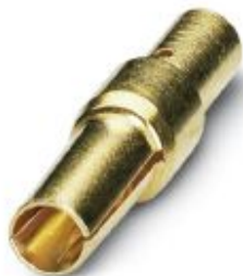
Crimp contact, turned, Single contact, contact diameter: 1 mm, crimp range: 0.08 mm 2 ... 0.22 mm 2

Please be informed that the data shown in this PDF Document is generated from our Online Catalog. Please find the complete data in the user's documentation. Our General Terms of Use for Downloads are valid ( http://phoenixcontact.com/download )