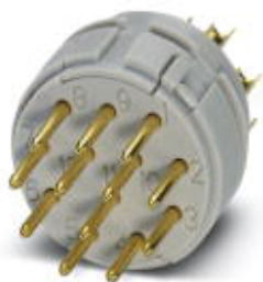
Contact insert, number of positions: 12, type of contact: Pin, Solder connection

Please be informed that the data shown in this PDF Document is generated from our Online Catalog. Please find the complete data in the user's documentation. Our General Terms of Use for Downloads are valid ( http://phoenixcontact.com/download )