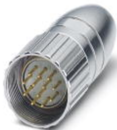
Cable connector, straight, shielded: yes, Screw locking, M23, No. of pos.: 12, type of contact: Pin, Crimp connection, cable diameter range: 3 mm ... 10.5 mm

Please be informed that the data shown in this PDF Document is generated from our Online Catalog. Please find the complete data in the user's documentation. Our General Terms of Use for Downloads are valid ( http://phoenixcontact.com/download )