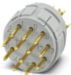
Contact insert, number of positions: 12, type of contact: Pin, Solder connection

Please be informed that the data shown in this PDF Document is generated from our Online Catalog. Please find the complete data in the user's documentation. Our General Terms of Use for Downloads are valid ( http://phoenixcontact.com/download )