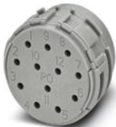
Contact insert, number of positions: 12, type of contact: Pin, Crimp connection

Please be informed that the data shown in this PDF Document is generated from our Online Catalog. Please find the complete data in the user's documentation. Our General Terms of Use for Downloads are valid ( http://phoenixcontact.com/download )