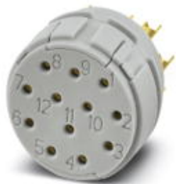
Contact insert, number of positions: 12, type of contact: Socket, Solder connection

Please be informed that the data shown in this PDF Document is generated from our Online Catalog. Please find the complete data in the user's documentation. Our General Terms of Use for Downloads are valid ( http://phoenixcontact.com/download )