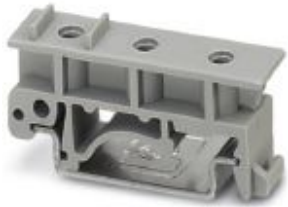
Foot element, color: gray

Please be informed that the data shown in this PDF Document is generated from our Online Catalog. Please find the complete data in the user's documentation. Our General Terms of Use for Downloads are valid ( http://phoenixcontact.com/download )