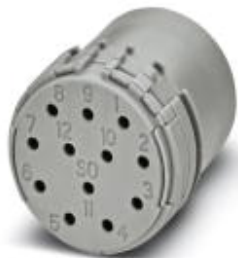
Contact insert, number of positions: 12, type of contact: Socket, Crimp connection

Please be informed that the data shown in this PDF Document is generated from our Online Catalog. Please find the complete data in the user's documentation. Our General Terms of Use for Downloads are valid ( http://phoenixcontact.com/download )