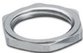
M20 x 1.5 locking nut

Please be informed that the data shown in this PDF Document is generated from our Online Catalog. Please find the complete data in the user's documentation. Our General Terms of Use for Downloads are valid ( http://phoenixcontact.com/download )