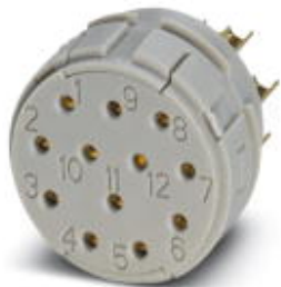
Contact insert, number of positions: 16, type of contact: Socket, Solder connection

Please be informed that the data shown in this PDF Document is generated from our Online Catalog. Please find the complete data in the user's documentation. Our General Terms of Use for Downloads are valid ( http://phoenixcontact.com/download )