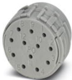
Contact insert, number of positions: 17, type of contact: Pin, Crimp connection

Please be informed that the data shown in this PDF Document is generated from our Online Catalog. Please find the complete data in the user's documentation. Our General Terms of Use for Downloads are valid ( http://phoenixcontact.com/download )