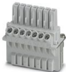
DUPLICON, connector contact insert, 6 x 4 mm 2 + PE, 400/690 V, 25 A, screw connection, type B6, IP20 protection

Please be informed that the data shown in this PDF Document is generated from our Online Catalog. Please find the complete data in the user's documentation. Our General Terms of Use for Downloads are valid ( http://phoenixcontact.com/download )