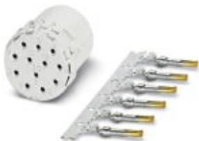
The figure shows the 12-pos. product version

Contact insert, number of positions: 17, type of contact: Socket, Crimp connection