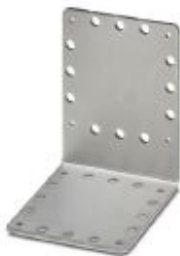
DUPLICON, mounting bracket, made of 3 mm high-grade steel plate, with predrilled holes

Please be informed that the data shown in this PDF Document is generated from our Online Catalog. Please find the complete data in the user's documentation. Our General Terms of Use for Downloads are valid ( http://phoenixcontact.com/download )