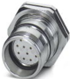
Device connector for rear wall, straight, shielded: yes, Screw locking, M23, Axial O-ring, Central fastening M25 x 1.5, Panel thickness min.: 0.8 mm, Panel thickness max.: 6.5 mm

Please be informed that the data shown in this PDF Document is generated from our Online Catalog. Please find the complete data in the user's documentation. Our General Terms of Use for Downloads are valid ( http://phoenixcontact.com/download )