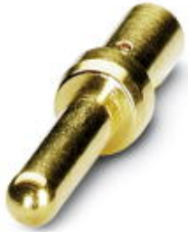
Crimp contact, turned, Single contact, contact diameter: 1 mm, crimp range: 0.5 mm 2 ... 1 mm 2

Please be informed that the data shown in this PDF Document is generated from our Online Catalog. Please find the complete data in the user's documentation. Our General Terms of Use for Downloads are valid ( http://phoenixcontact.com/download )