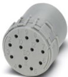
Contact insert, number of positions: 16+2+PE, type of contact: Socket, Crimp connection

Please be informed that the data shown in this PDF Document is generated from our Online Catalog. Please find the complete data in the user's documentation. Our General Terms of Use for Downloads are valid ( http://phoenixcontact.com/download )