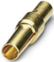
Crimp contact, turned, contact diameter: 2 mm, crimp range: 0.75 mm 2 ... 1 mm 2

Please be informed that the data shown in this PDF Document is generated from our Online Catalog. Please find the complete data in the user's documentation. Our General Terms of Use for Downloads are valid ( http://phoenixcontact.com/download )