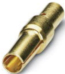
Crimp contact, turned, contact diameter: 2 mm, crimp range: 0.5 mm 2 ... 0.75 mm 2

Please be informed that the data shown in this PDF Document is generated from our Online Catalog. Please find the complete data in the user's documentation. Our General Terms of Use for Downloads are valid ( http://phoenixcontact.com/download )