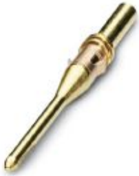
Crimp contact, turned, contact diameter: 1 mm, crimp range: 0.14 mm 2 ... 0.75 mm 2

Please be informed that the data shown in this PDF Document is generated from our Online Catalog. Please find the complete data in the user's documentation. Our General Terms of Use for Downloads are valid ( http://phoenixcontact.com/download )