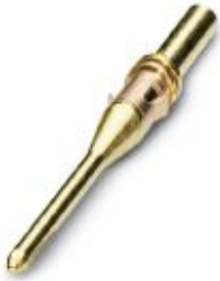
Crimp contact, turned, contact diameter: 1 mm, crimp range: 0.25 mm 2 ... 0.5 mm 2

Please be informed that the data shown in this PDF Document is generated from our Online Catalog. Please find the complete data in the user's documentation. Our General Terms of Use for Downloads are valid ( http://phoenixcontact.com/download )