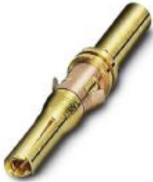
Crimp contact, turned, contact diameter: 1 mm, crimp range: 0.25 mm 2 ... 0.5 mm 2

Please be informed that the data shown in this PDF Document is generated from our Online Catalog. Please find the complete data in the user's documentation. Our General Terms of Use for Downloads are valid ( http://phoenixcontact.com/download )