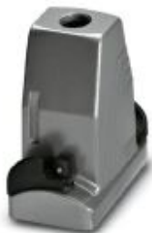
HEAVYCON ADVANCE standard powder-coated sleeve housing B6, with bayonet locking, height 100 mm, with 1xM20 thread, straight cable outlet

Please be informed that the data shown in this PDF Document is generated from our Online Catalog. Please find the complete data in the user's documentation. Our General Terms of Use for Downloads are valid ( http://phoenixcontact.com/download )