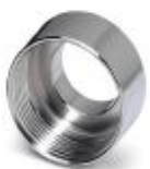
Step-up adapter, M20 to M25, including O-ring

Extension adapter - ENLAR-M-KV-M20/M25 - 1647666