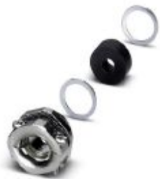
Cable gland, shielded: no, cable diameter range: 8 mm ... 12 mm

Please be informed that the data shown in this PDF Document is generated from our Online Catalog. Please find the complete data in the user's documentation. Our General Terms of Use for Downloads are valid ( http://phoenixcontact.com/download )