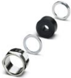
Cable gland, shielded: no, cable diameter range: 6 mm ... 10 mm

Please be informed that the data shown in this PDF Document is generated from our Online Catalog. Please find the complete data in the user's documentation. Our General Terms of Use for Downloads are valid ( http://phoenixcontact.com/download )