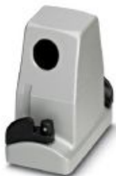
HEAVYCON ADVANCE EMV sleeve housing B10, with bayonet locking, height 100 mm, with 1xM25 thread, lateral cable outlet

Please be informed that the data shown in this PDF Document is generated from our Online Catalog. Please find the complete data in the user's documentation. Our General Terms of Use for Downloads are valid ( http://phoenixcontact.com/download )