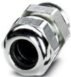
Cable gland, shielded: no, cable diameter range: 9 mm ... 13 mm

Please be informed that the data shown in this PDF Document is generated from our Online Catalog. Please find the complete data in the user's documentation. Our General Terms of Use for Downloads are valid ( http://phoenixcontact.com/download )