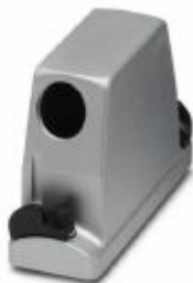
HEAVYCON ADVANCE EMV sleeve housing B24, with bayonet locking, height 100 mm, with 1xM32 thread, lateral cable outlet

Please be informed that the data shown in this PDF Document is generated from our Online Catalog. Please find the complete data in the user's documentation. Our General Terms of Use for Downloads are valid ( http://phoenixcontact.com/download )