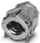
Cable gland - HC-M-KV-Z-M40 - 1646175

Metal screw connection with strain relief clamp, thread length: 8 mm, cable sealing area: 24 - 33 mm, clamping area: 26 - 36 mm, SW 50, screw connection: M40