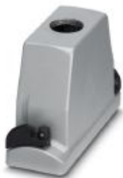
HEAVYCON ADVANCE EMV sleeve housing B24, with bayonet locking, height 100 mm, with 1x M40 thread, straight cable outlet

Please be informed that the data shown in this PDF Document is generated from our Online Catalog. Please find the complete data in the user's documentation. Our General Terms of Use for Downloads are valid ( http://phoenixcontact.com/download )