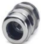
Cable gland - G-INSEC-M40-M68N-NCRS-S - 1411192

Cable gland, cable gland material: Nickel-plated brass, external cable diameter 19 mm ... 27 mm, shielding: yes, connecting thread: M40 x 1.5, color: silver, with O-ring