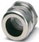
Cable gland - HC-M-KV-M40(27-34) - 1607729

Metal screw connection up to 5 bar, thread length: 8 mm, cable diameter: 27 ... 34 mm, WAF 50, screw connection: M40