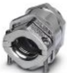
Cable gland - HC-M-KV-Z-M40 - 1646175

Metal screw connection with strain relief clamp, thread length: 8 mm, cable sealing area: 24 - 33 mm, clamping area: 26 - 36 mm, SW 50, screw connection: M40